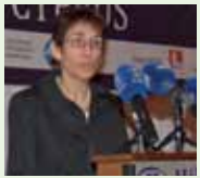
Mrs Praxoula Antoniadou Kyriacou, Minister of Commerce, Industry and Tourism.

The Cyprus Institute in collaboration with the Cyprus Industrialists and Employers Federation and the Electricity Authority of Cyprus organized in October 2011 a Workshop entitled "Energy issues facing Cyprus". In this one-day workshop the participating scientists reviewed the current energy issues facing Cyprus today, in the light of the