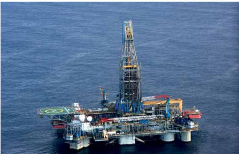
The discovery of significant natural gas resources under the waters of the eastern Mediterranean holds the promise of a similar energy game-changing experience for Cyprus and some of its neighbors.

Ernest J. Moniz is the ‘Cecil and Ida Green Distinguished Professor of Physics and Engineering Systems’ at MIT, Director of MIT’s Energy Initiative, 2008 Awardee of the Grand Cross of the Order of Makarios III and Member of Cyl’s Board of Trustees.