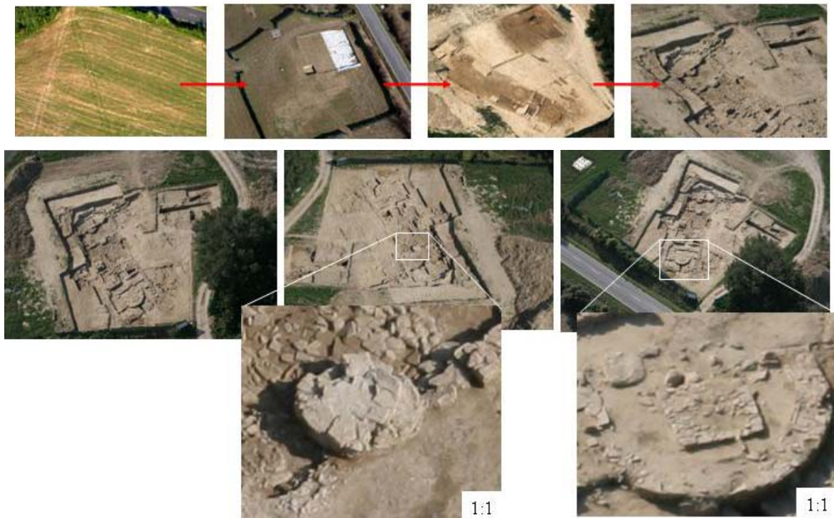
Figure 1: The excavation area of Pava (40x30m) near Siena (Italy) from the original inspection through the first excavations and actual situation. The aerial images have been acquired for simple documentation without any planning for 3D modeling. A zoom 1:1 of the details is also presented.

Our first case study focuses on the excavation of a late antiquity-early medieval church at Pava in the province of Siena, Italy (Figure 1).