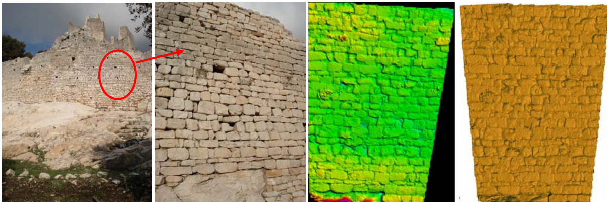
Figure 3: S.Silvestro rock near Piombino (Italy) and the detailed 3D modeling of its rock walls, simply from 3 convergent images acquired with a consumer grade digital camera with 6 Mega pixels.

The second study relates to a masonry castle on the coast near Piombino (Italy), excavated by the University of Siena in the 1980s. Here, we generated a 3D model of the defensive walls and some of the buildings in the interior using ground-based photographs. As it is possible to see in Figure 3, it is quite hard to get close to the monument because of the rocky and steep morphology of the site. Here the goal was to test whether images could be the right and easiest solution to document some detailed parts of the archaeological site. In particular, a part of the wall of the castle and the interior of an old church were selected. We generated a 3D model of the defensive walls using three images acquired with a simple, portable and very cheap digital camera. The derived DSM (Figure 3) is pretty detailed and the single elements of the wall are well recognizable.